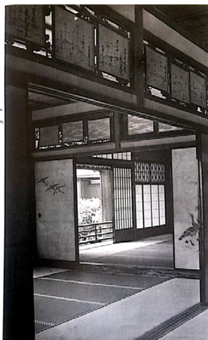
FIG. 1 Letter sent by Coderch to Alison Smithson in 1967.

En una era de rápido aumento en la población mundial, de avance tecnológico y, sobre todo, de esperanzas, el arquitecto debe resolver el problema de proporcionar abrigo a un número creciente de personas, de organizar las complejidades del tráfico y de las comunicaciones y de, en suma, deparar una vida más perfecta al ciudadano en una sociedad comunal.