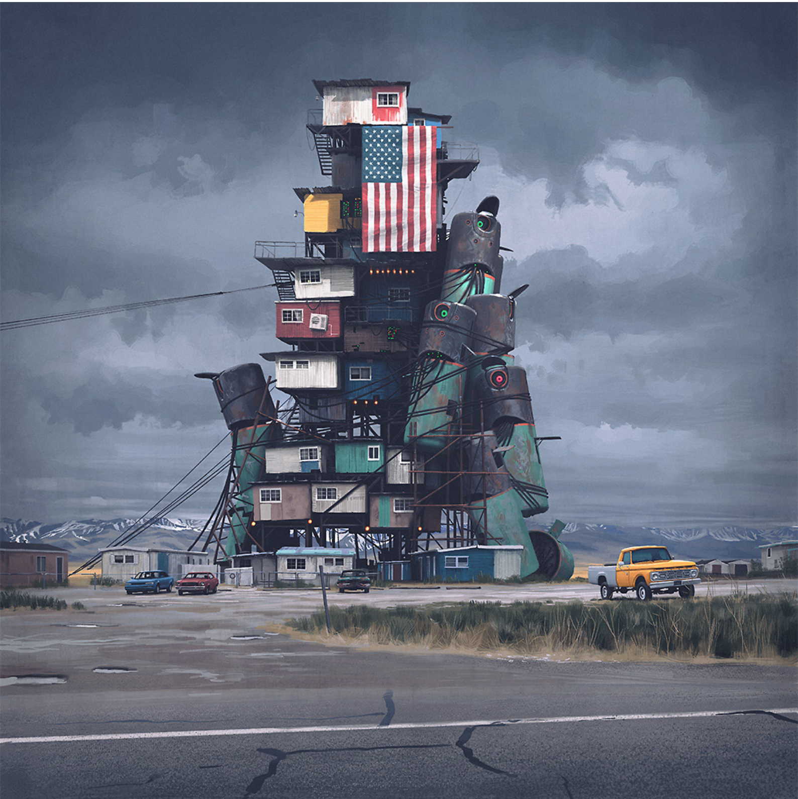
FIG. VI "Whole apartment complex that looked like they were getting their energy from salvaged suspension engines had sprung up there", Simon Stålenhag, The Electric State , p. 41, 2017, © 2017 Simon Stålenhag