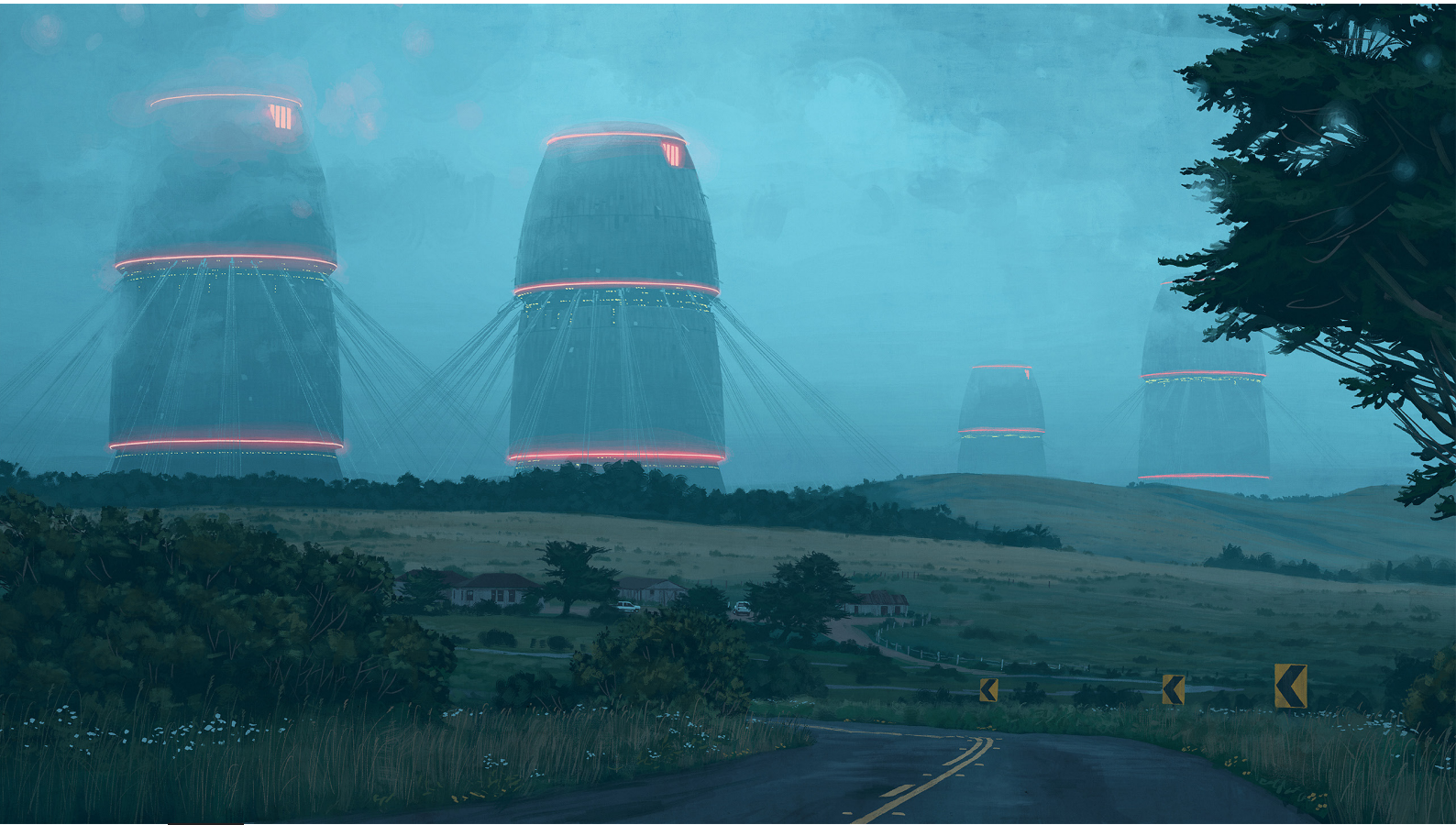
FIG. VII Simon Stålenhag, The Electric State , pp. 78-79, 2017 © 2017 Simon Stålenhag