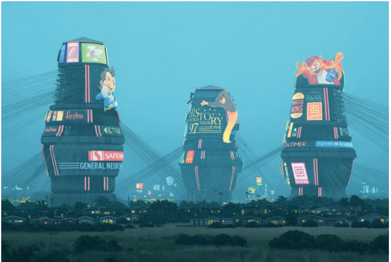
FIG. 6 "The sky was vaguely bluish, and out there in the morning light we passed a never-ending stream of small towns and suburbs", Simon Stålenhag, The Electric State , p. 46, 2017 © 2017 Simon Stålenhag