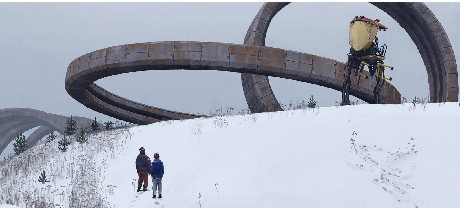
FIG. V Simon Stålenhag, Things from the Loop , pp. 48-49,, 2016 © 2016 Simon Stålenhag