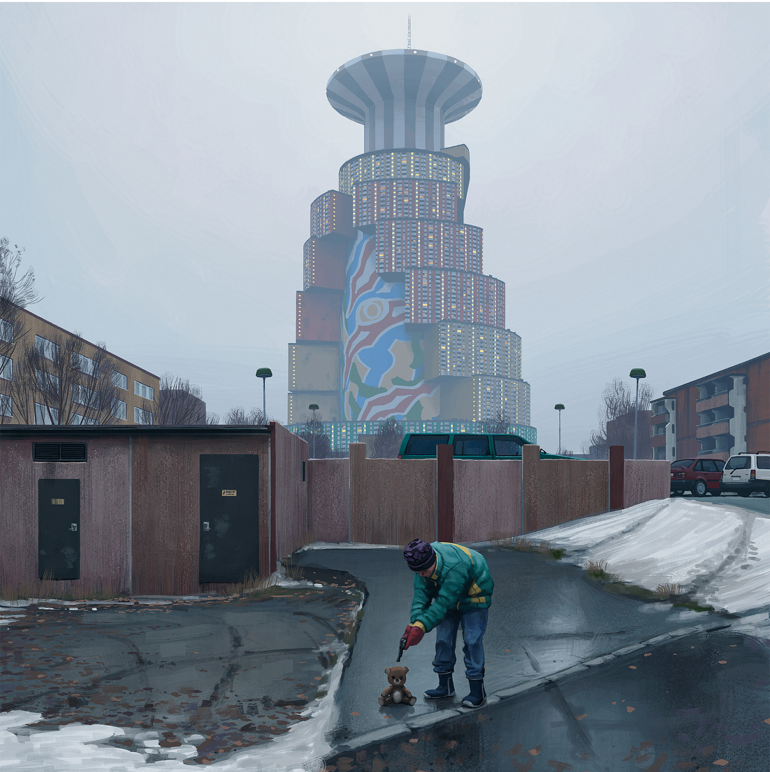
FIG. IV Things from the Loop , pp. 22-23, 2015 © 2016 Simon Ståhlenhag