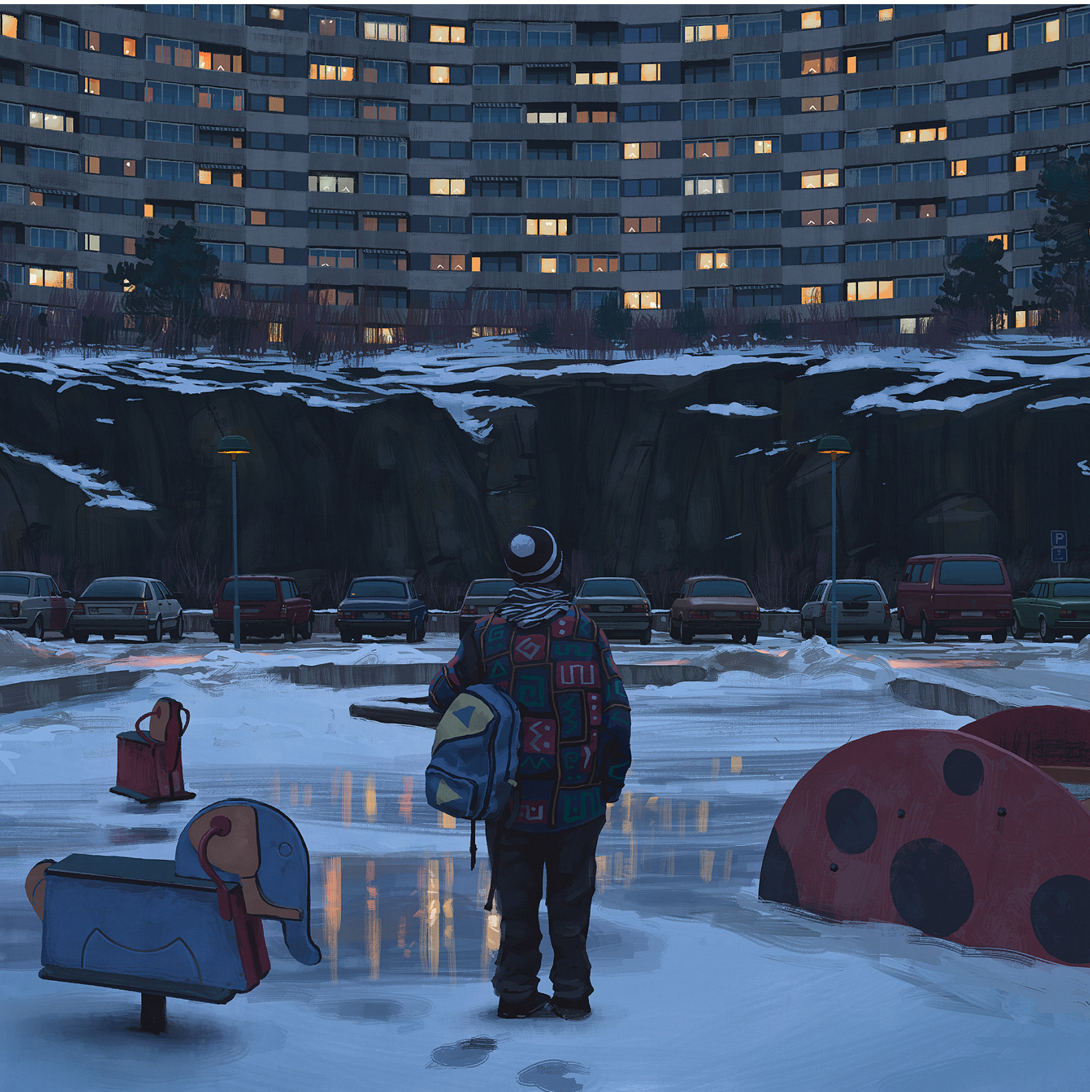
FIG. III "The apartment was at the bottom of the Hågerstalund's Diving Tower, one of the twelve vertical cities in Mälardalen. They were built between 1965 and 1970 as a part of a major public housing program, and Hågerstalund alone consisted of about 1,500 apartments. The ground level held a subway station, library, school, daycare, and shops. The tower was crowned with the characteristic water tower." Simon Stålenhag, Things from the Loop , pp. 16-17, 2015 © 2016 Simon Stålenhag