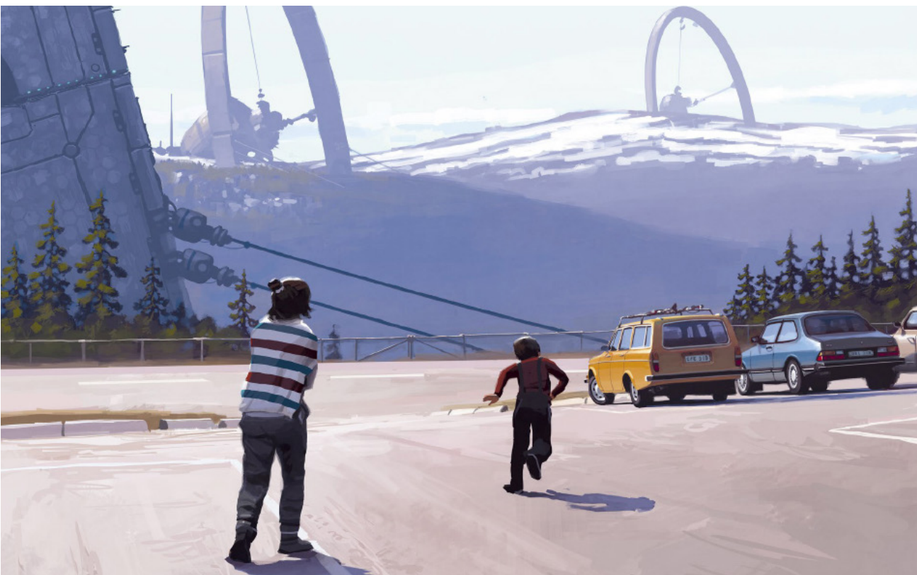
FIG. 5 "The arch towers at Klövsjö", Simon Stålenhag, Tales from the Loop, p. 15, 2015

The first image I made was actually a dinosaur in an orchard. I did it in 2011 and it was the piece that let me think of ways to write a story where robots and dinosaurs could exist in the same place while also being set in my childhood. So I started writing about a very strong secret particle accelerator deep underground the small town that I grew up in, and I tried to imagine how it would have been if that facility really had existed when I was a kid and what memories I would have had from that time.