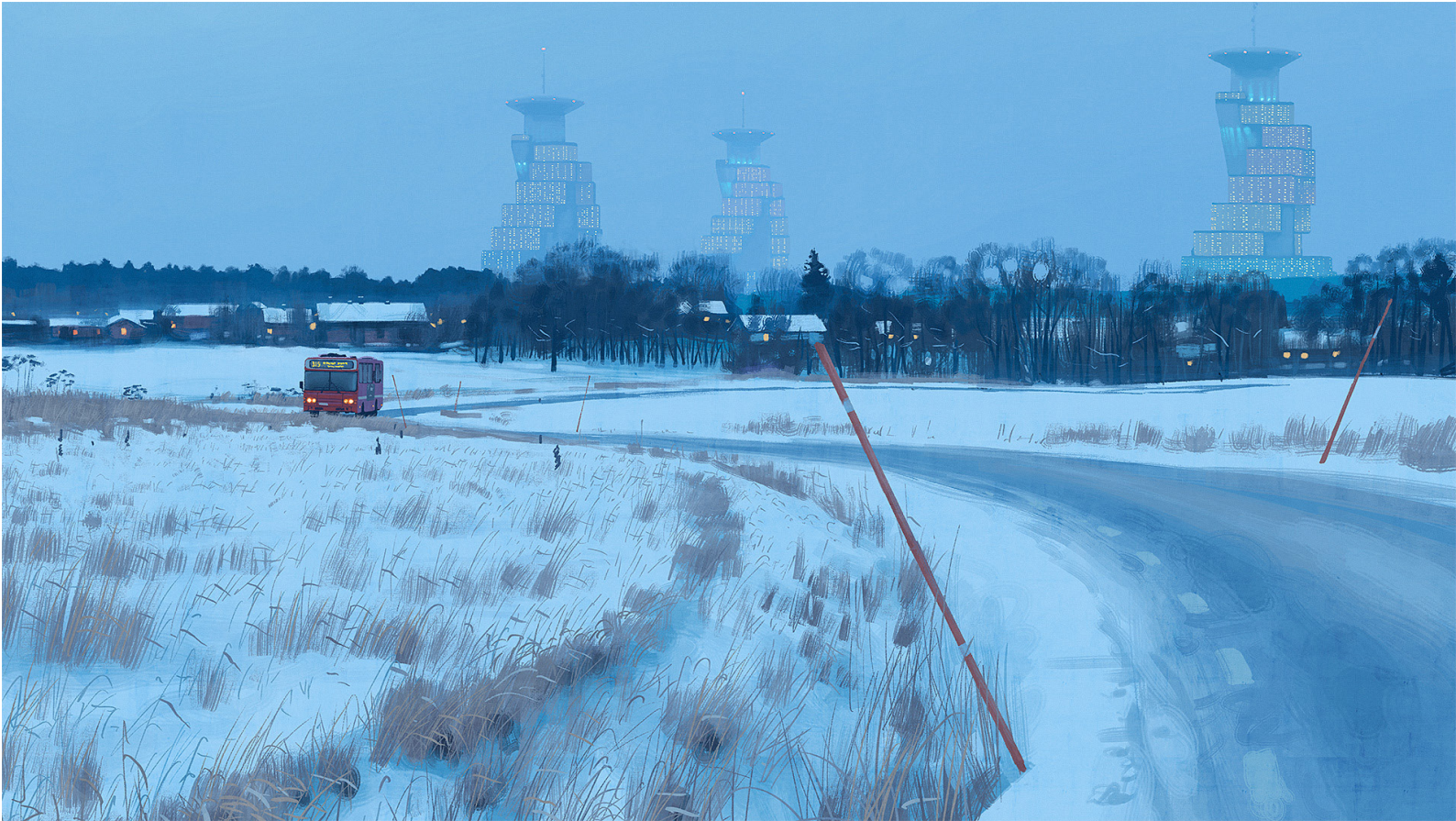
FIG. II Things from the Loop , pp. 12-13, 2015 © 2016 Simon Stålenhag