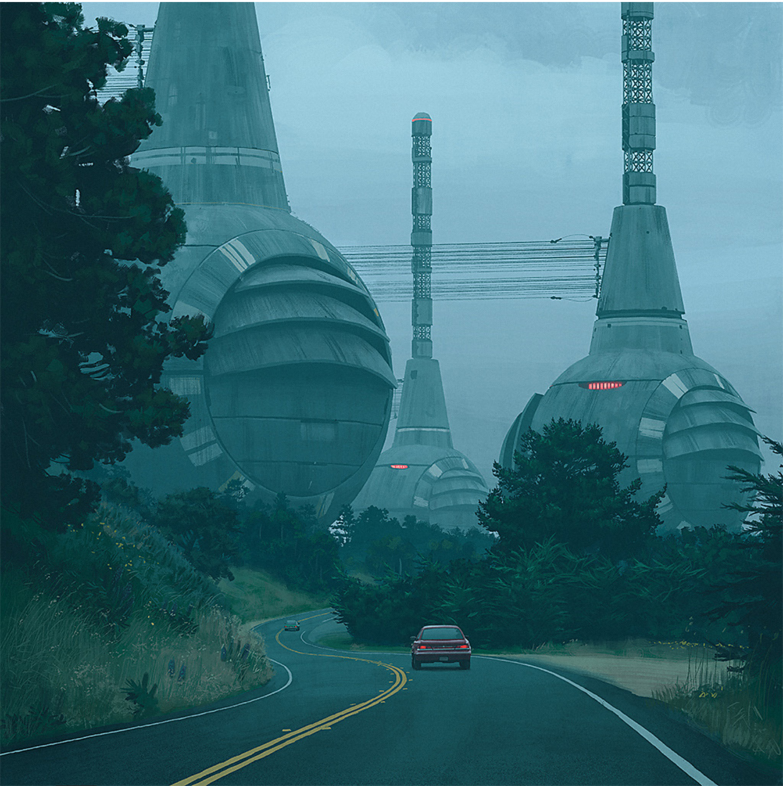
FIG. VII Simon Ståhlenhag, The Electric State , p. 92, 2017, © 2017 Simon Ståhlenhag