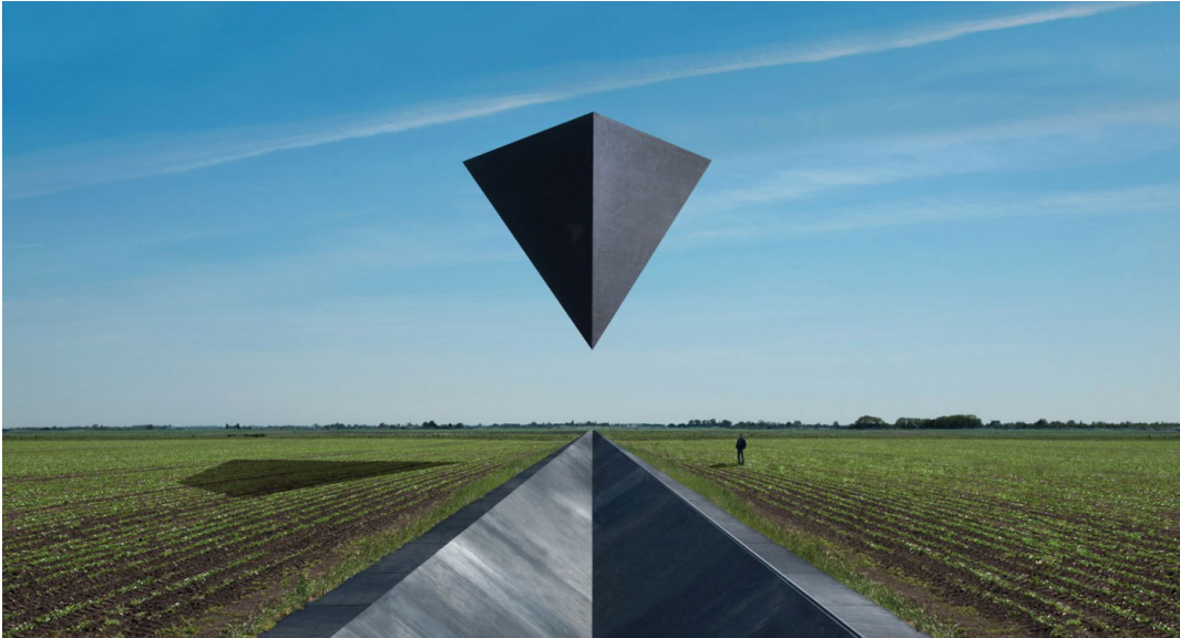
FIG. 4 Storm Thorgerson, The big groove, cover for "Synrise" album by Goose, 2010 © 2010 Storm Thorgerson